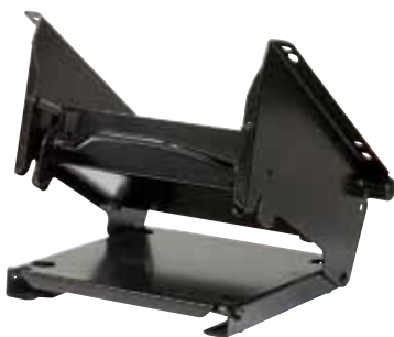
Quick Fitting Console shown with base plate