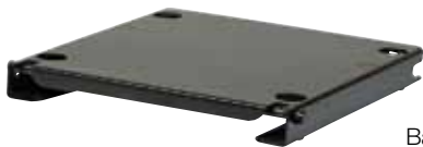
Base plate for QFC