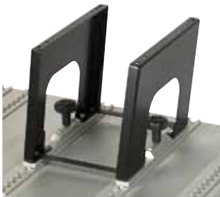
Legs with rail fittings for Heavy Duty air line floor rails, available in different heights