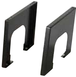
Legs for fixed mounting, available in different heights