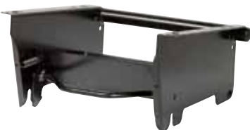
Quick Fitting Console (QFC), available in different heights