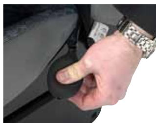
Inflatable lumbar support (air lumbar)

The comfort seat is also available with an air lumbar – lumbar support, adjustable armrest and slide rails.