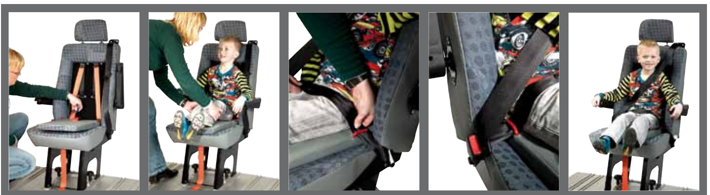
Children in Group 3 are secured by means of the built-in 3-point belt. The belt should pass under the red hooks on either side of the child's hips