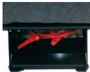
Practical storage compartment in the QFC console