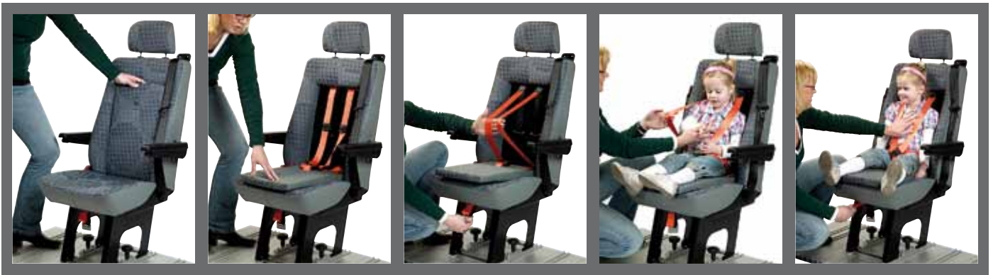
Children in Groups 1 & 2 are secured with the built-in 5-point Harness.